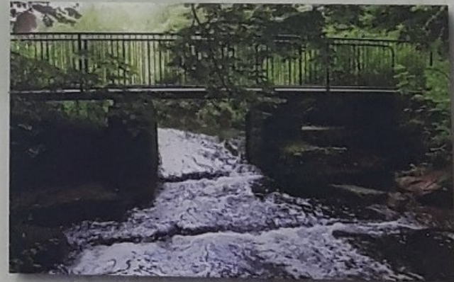
Downstream of the viaduct, under