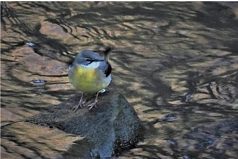
Grey Wagtail-juvenile-Quarry Lane-10/12/2021

Rarely seen on Oakham. A pair bred where the Maun enters Quarry Lane and one juvenile could still be seen in the same area until the end of the year.