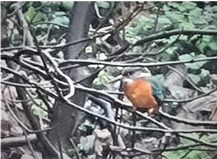
Kingfisher-Matlock Bridge - Quarry Lane - 27-12-2021